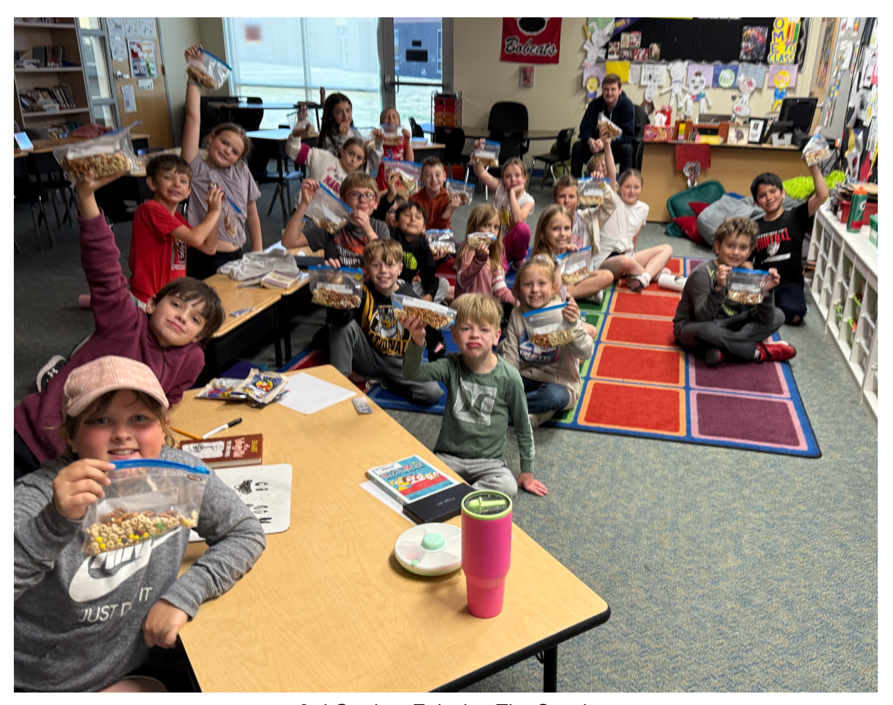
3rd Graders Enjoying The Snack