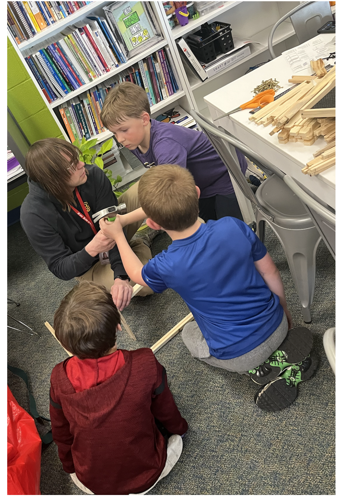
GAP is building our beehive.