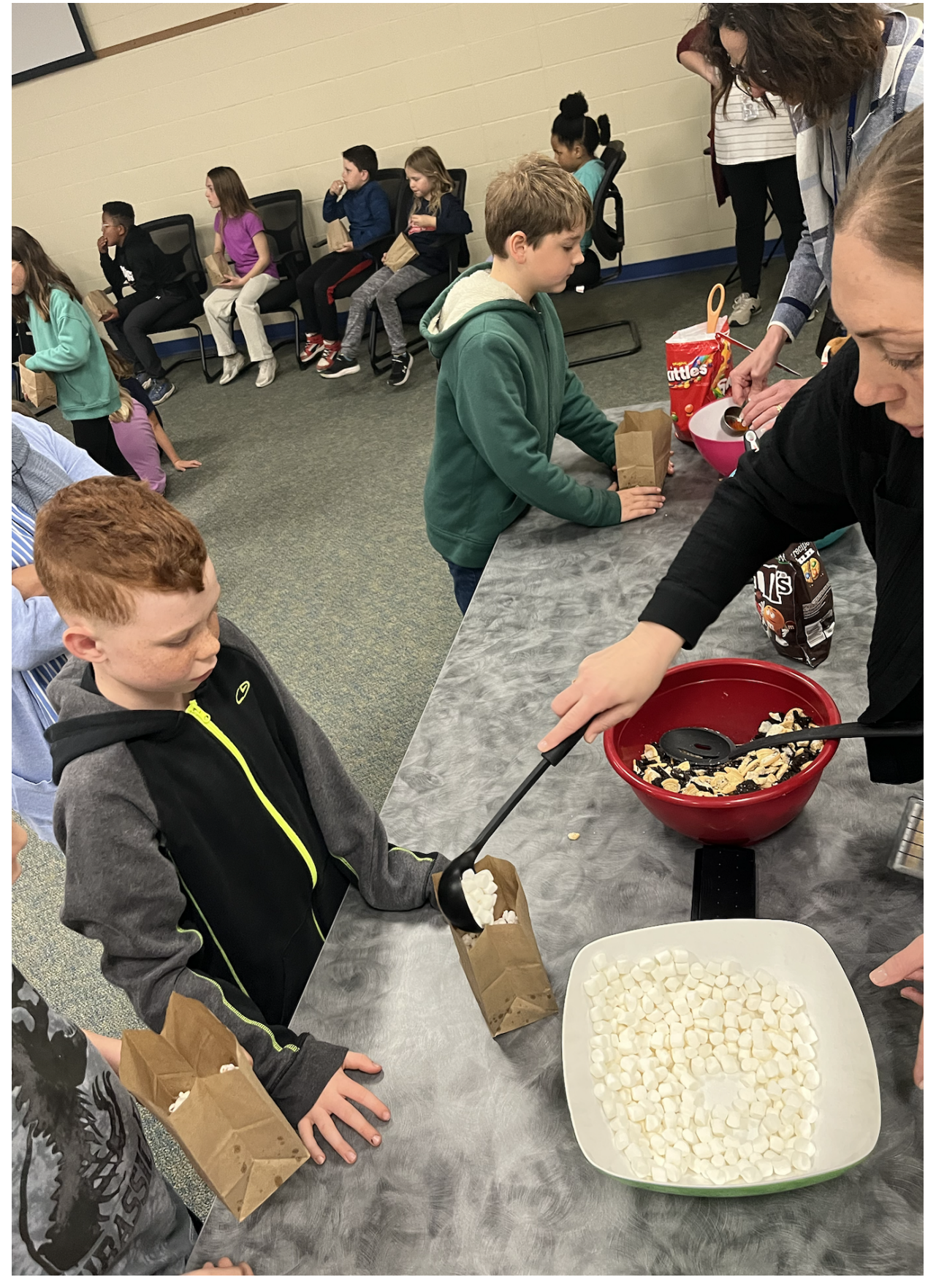
3rd Grade Popcorn Party